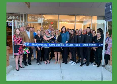
Ribbon Cutting for VIO Med Spa