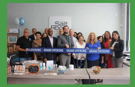
Ribbon Cutting for The Salt Room - Coral Springs