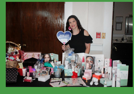
Shop Small Business Wake Up Breakfast Presented by Local Businesses