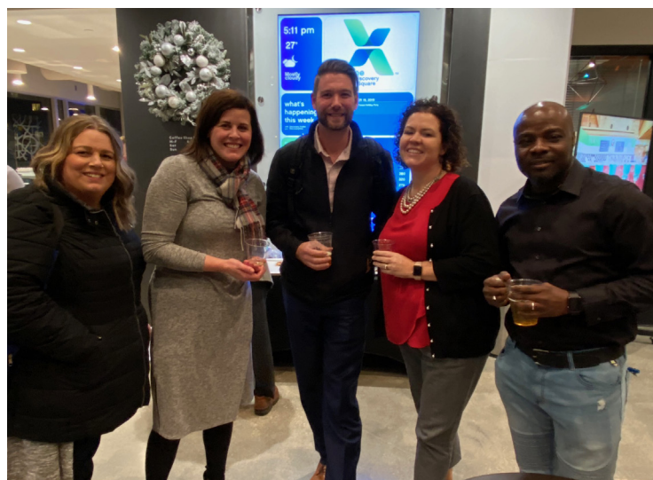
Business After Hours Holiday Party at One Discovery Square