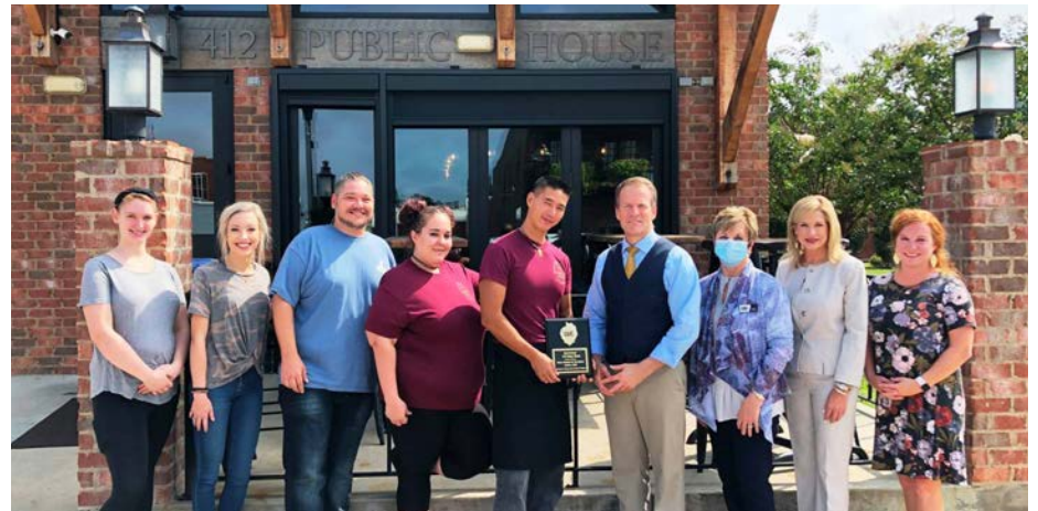
August Small Business of the Month: 412 Public House 412 2nd Ave SE Cullman, AL 35055

From storm, fire and water restoration to commercial services, they can help get your business back on track. They are also now offering the Certified SERVPRO Clean that will bring a new standard of sanitation to your home or office space.