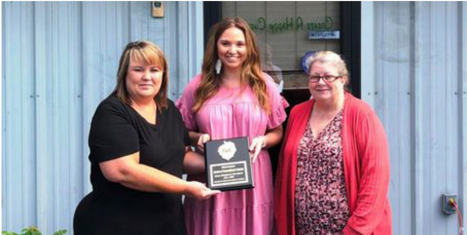
July Small Business of the Month: SERVPRO of Cullman/Blount Counties 8450 AL-157, Cullman, AL 35057

From storm, fire and water restoration to commercial services, they can help get your business back on track. They are also now offering the Certified SERVPRO Clean that will bring a new standard of sanitation to your home or office space.