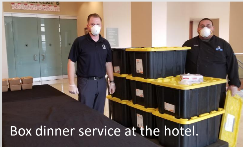
Box dinner service at the hotel.