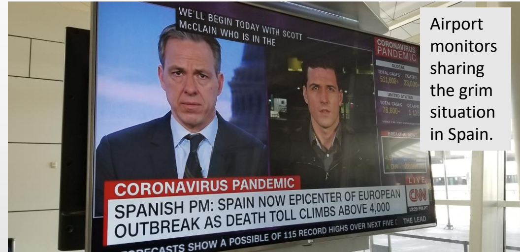
Airport monitors sharing the grim situation in Spain.