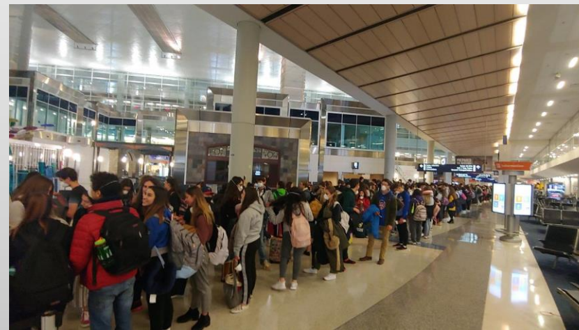
300 Spanish foreign exchange students waiting to board their charter flight at a deserted DFW Airport.