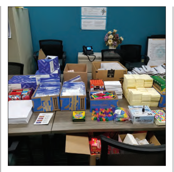
Ingham Great Start Collaborative (GSC) provides virtual workshops for families of threeyear-old children, engaging them in literacy development. Ingham offered these workshops to over 250 families whose students were eligible for Head Start but could not get into a preschool program. The workshops, being conducted in a five-week series, were made possible through the Engaging Families in Early Literacy (EFEL) grant provided by the Capital Area United Way.

ISD) has accepted a variety of personal protective equipment (PPE) donations from various companies and departments, including General Motors, Hanes, and the U.S. Department of Health and Human Services to name a few. The Department of Education, the Department of Health and Human Service, the Michigan State Police and the Michigan Community Service Commission, and the Michigan Association of Intermediate School Districts, have partnered to identify PPE needs of local school districts for distribution this fall.