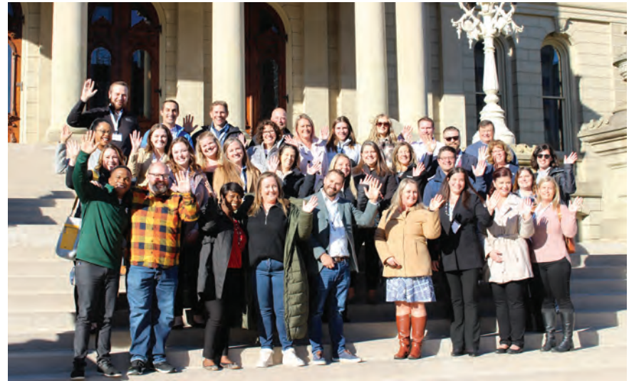
51 Leadership Lansing Participants

Leadership Lansing, now in its 9th year, boasts an alumni base of 295 individuals and is designed to develop a new generation of leaders in the Lansing region. The 2023-24 cohort marks the largest in program history.