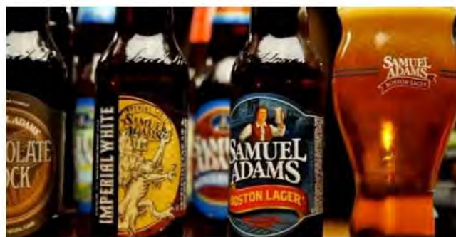
SAE1: Brewery Tour, Boston