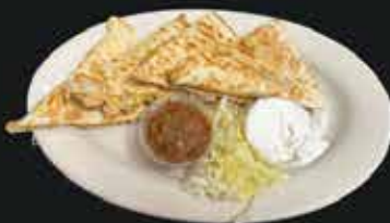
BEER CHEESE QUESADILLA