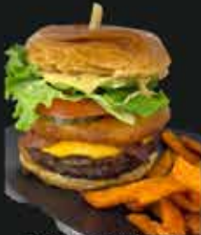
BEER CHEESE BURGER