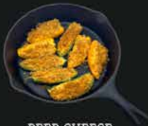
BEER CHEESE POPPERS