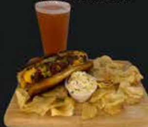
BEER CHEESE SMOKED BRAT