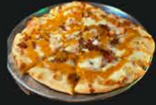
DRUNKEN TURKEY PERSONAL PIZZA