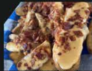
LOADED POTATO DIPPERS