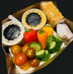
BEER CHEESE LUNCH BOX