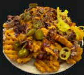
BEER CHEESE PULLED PORK WAFFLE FRIES