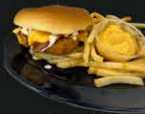
BACON BEER CHEESE CHICKEN SANDWICH