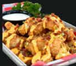
BEER CHEESE TOTS