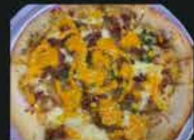
BEER CHEESE PIZZA