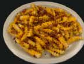
LOADED BEER CHEESE FRIES