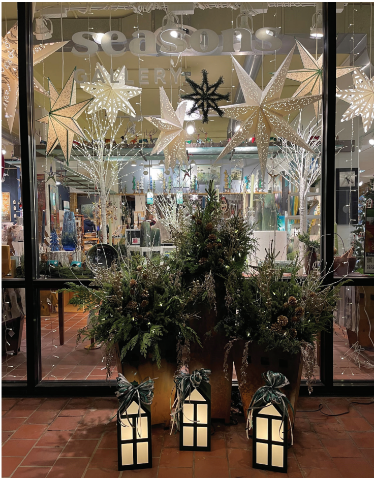
SEASONS Gallery: Lots of lights – string lights, hanging lights, different shapes ... all created a very bright, visually appealing display. ■