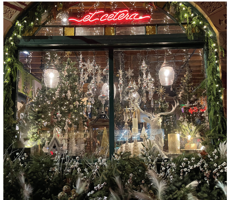
et cetera: A big WOW! Love the depth and layers.