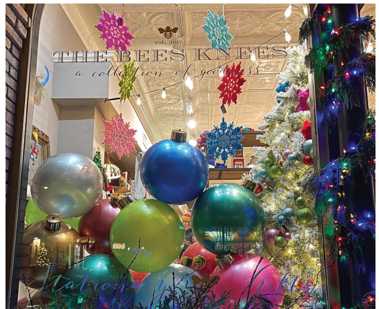
The Bees Knees: A celebration of color – Very festive!