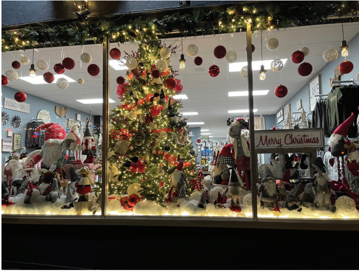
Rivergirl Gifts: Decorated inside and out, and maximized the window.