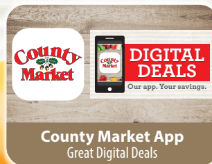
County Market App Great Digital Deals