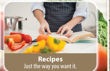
Recipes Just the way you want it.