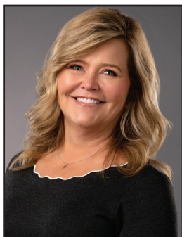
Kelli Cadwell Simply Staffing