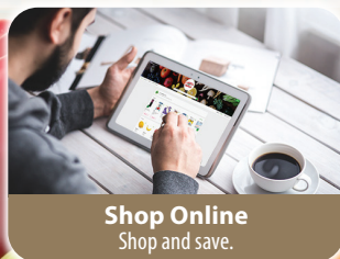
Shop Online Shop and save.