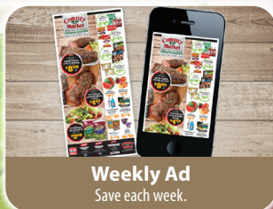
Weekly Ad Save each week.

Check out our website @ jerryscountymarket.com