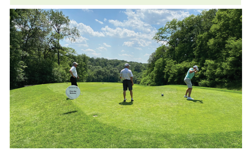
Golfers enjoyed a perfect day out on the course.