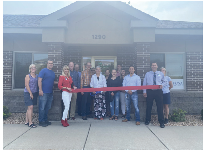
Diamond Stone Oriental Medicine, Inc. – located at 1290 Hosford St., Ste. D, Hudson. Specializing in acupuncture, botanical medicine, and various lifestyle recommendations. For more information, call (612) 201-8727.