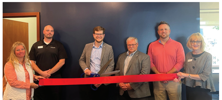
Family Friendly Workplaces, Inc. – located at 2466 County Rd. DD, Woodville. Family Friendly Workplaces, Inc. strives to elevate the success of families and children by contributing to building communities that thrive socially and economically. To learn more, call (715) 554-3441.