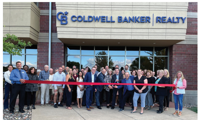
Coldwell Banker Realty – located at 2424 Monetary Blvd., Ste. 214, Hudson. Helping you find homes for sale, rentals, condos, Realtors and information about your local real estate market. Be sure to check out their new location! For more information, call (715) 386-9060.