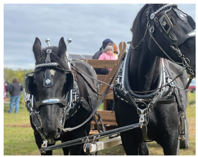
Children and parents alike enjoyed wagon rides pulled by Clydesdale horses.