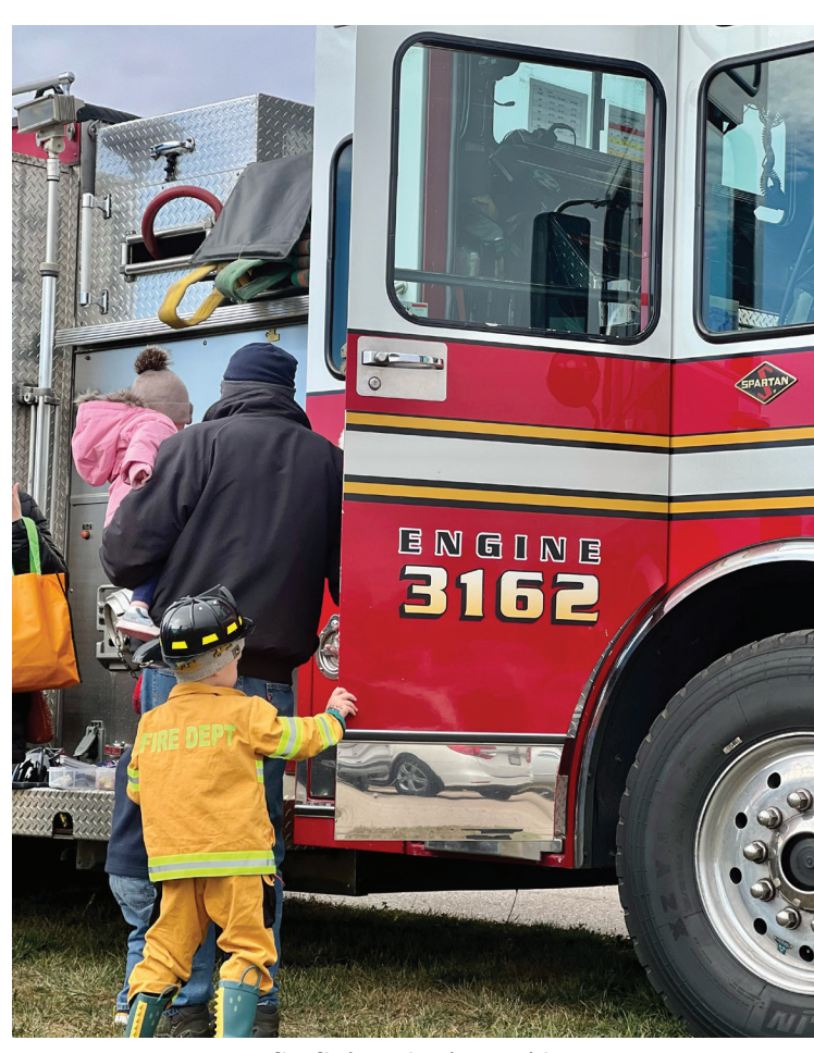
A firefighter in the making!

DISCOVER HUDSON FACEBOOK: REACH: 17,393, LIKES: 16,842 DISCOVER HUDSON INSTAGRAM: REACH: 5,336, FOLLOWERS: 4,709