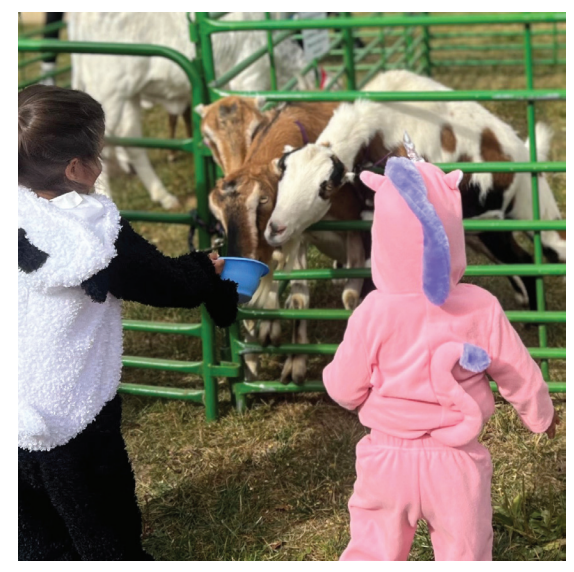
Children feeding animals from the petting zoo.