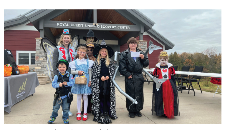
The winners of the costume contest.