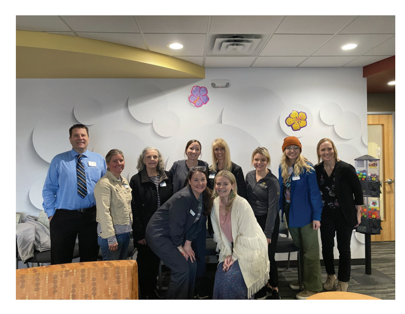
The Hudson Ambassadors recently paid a visit to Smiles in Motion, Pediatric Dentistry for their March member retention visit. Ambassadors were given an extensive tour of the facility, and even had a short Q&A session to close out the visit.