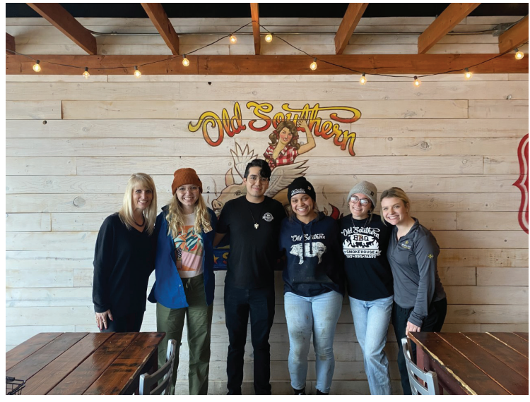
The Hudson Ambassadors also made a visit to Old Southern BBQ Smokehouse for their March meeting. ■