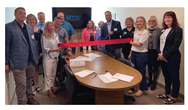
Growth Management Solutions – located at 1091 Sutherland Ave, River Falls. By possessing the necessary tools to empower you in making informed decisions about your technology, our primary objective is to optimize your time to focus on growing your business. For more information, <u>click here</u>.