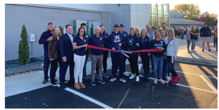
Hudson Hockey Association – located at 1820 Hanley Road, Hudson. Our mission is to provide and promote equal opportunities and positive experiences for all Hudson area youth in skating and related activities. Check out our newly renovated facility. For more information, <u>click here</u>.