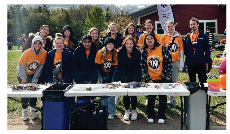
Youth Action Hudson at the YMCA helped kids decorate their pumpkins! ■