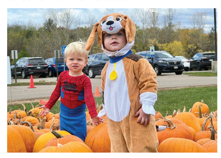
Scooby-Doo and Spiderman checking out the Pumpkin Patch! All kids received one free pumpkin to decorate, thanks to Minuteman Press - Hudson.

Thank you, Hudson EMS, Police, and Fire, for displaying your vehicles for the kids to interact with.