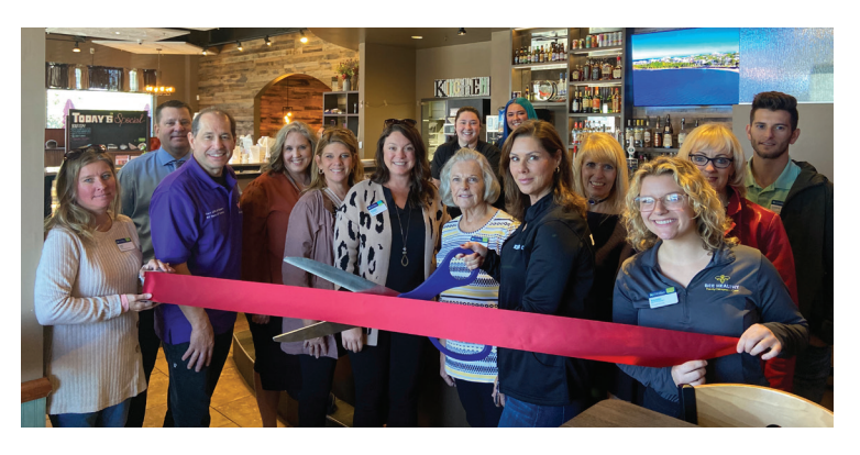
Keys Café & Bakery – located at 840 Carmichael Rd, Hudson. Our philosophy is simple: memorable service and absolutely the best food. Breakfasts, lunches, dinners, and desserts created from scratch recipes "you grew up with." Be sure to stop by and check out our new bar, now open until 8:00 p.m. on Thursdays through Saturdays. For more information, click here.