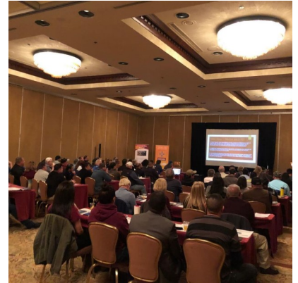
Table Cost: $500/event