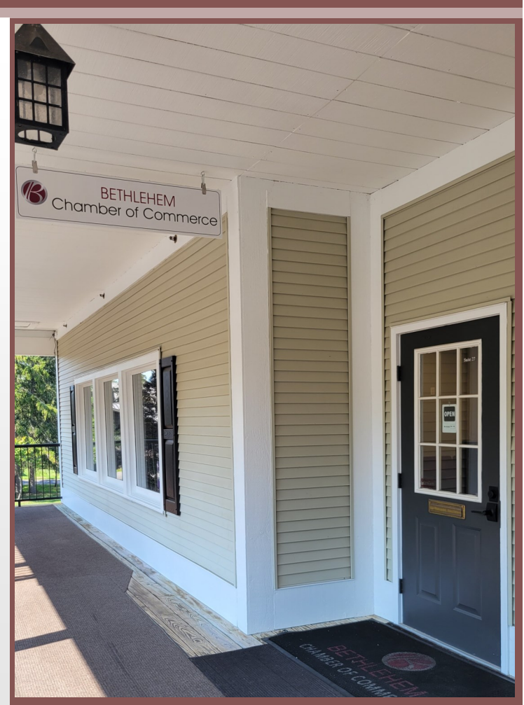
Stop by our offices at 318 Delaware Ave, 2nd Fl and say hello

The Bethlehem Chamber of Commerce supports its members and the community creating a positive business environment through education, government relations, promotion and advocacy services.