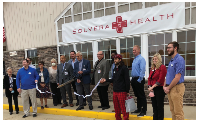
Solvera Healthcare Center celebrating their Grand Opening. All the care you need...under one roof! Welcome to the Chamber!