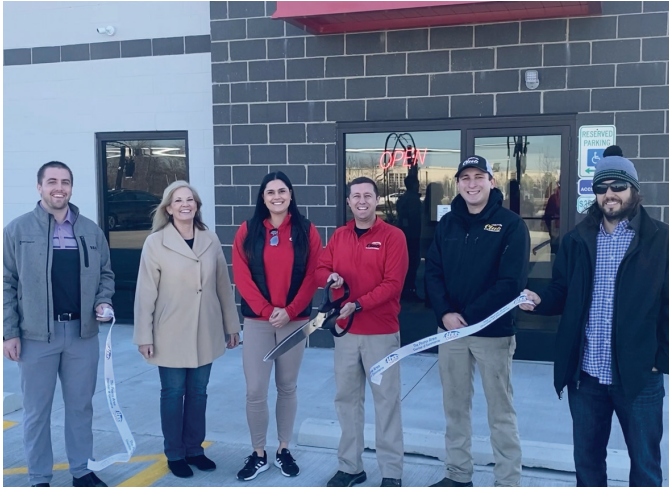
Club Carwash celebrating the Grand Opening of their 3rd Peoria location on West Holiday Drive.