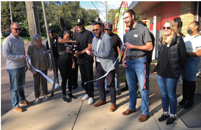
N & Out Market celebrating their Grand Opening. Check out this locally owned store—groceries and so much more!