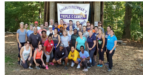
Leadership Charlottesville Class of 2020

Helping greater Charlottesville build an active corps of informed and civically-engaged leaders.