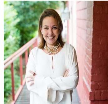
Albemarle County Public Schools & MACAA