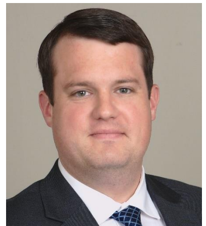
Atlantic Union Bank