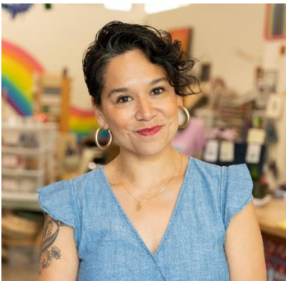
The Scrappy Elephant