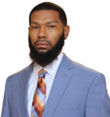
City of Charlottesville