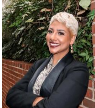
Charlottesville United for Public Education