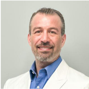
Studio R Aesthetics