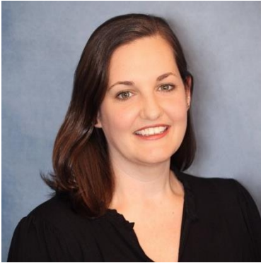
VIA Centers for Neurodevelopment