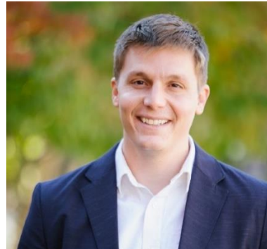
Community Climate Collaborative (C3)