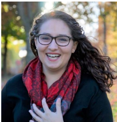
Central VA SBDC