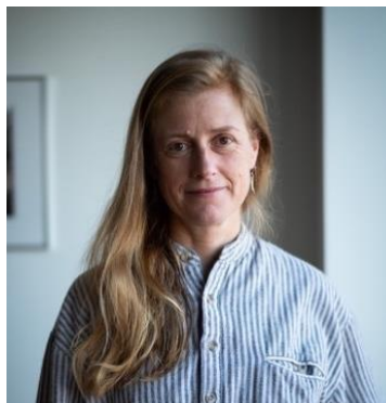
Artist & Collaborator