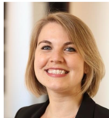
University of Virginia