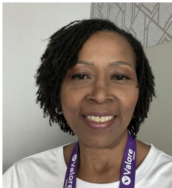
University of Virginia