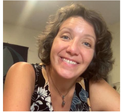
ACPS Family Council