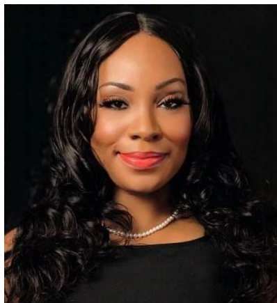
Chic & Classy Image Consulting