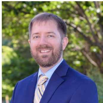
County of Albemarle