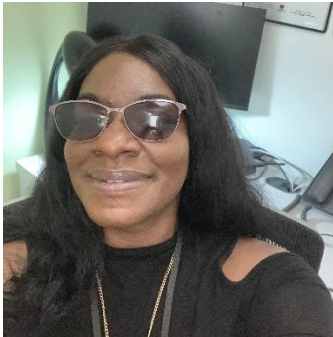
City of Charlottesville Eudamonia LLC