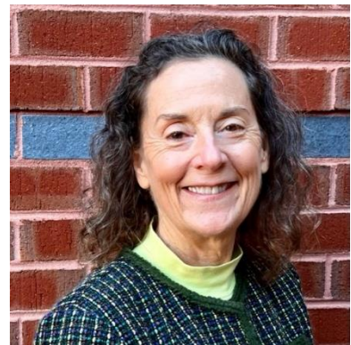
Cary Street Partners