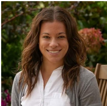
The Miller School of Albemarle