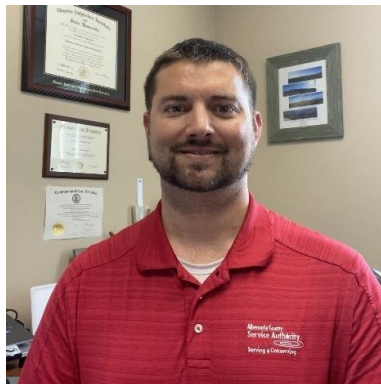
Albemarle County Service Authority