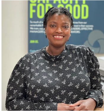
Center for Nonprofit Excellence