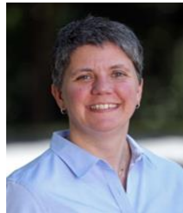
Rivanna Water & Sewer Authority