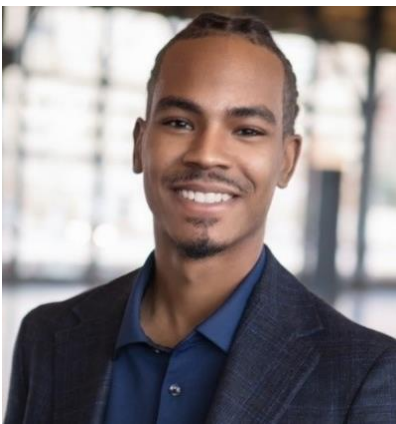
The Hogan Group