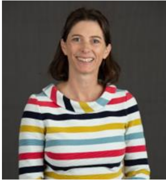
Self - Employed