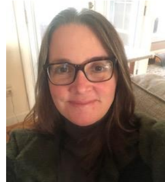
Charlottesville Albemarle SPCA