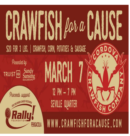
Crawfish for a Cause

Wednesday, March 4th at 4:30pm in Apple Annie's. Drink specials & light appetizers. Sponsored by: D.R. Horton. Interested in Sponsoring? Learn More!