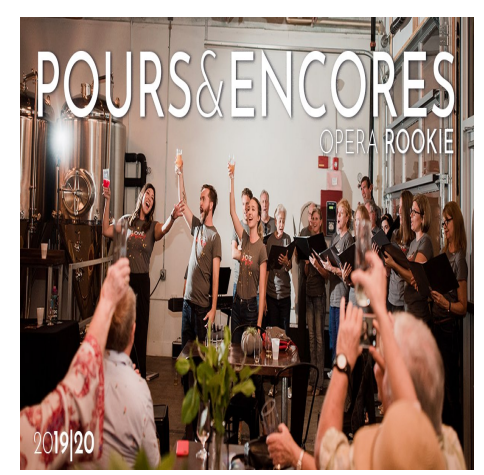
Pours & Encores

When the Sun Goes Down A II Springtime long! Drink specials, great food, live music, piano show, dance club & more!