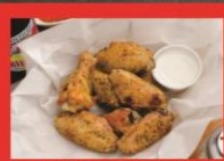
LEMON PEPPER BAKED WINGS