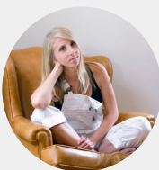
Eniko Ujj @enikoujj