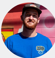
Monty Welt @montywelt