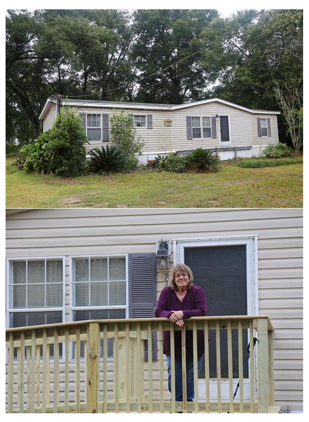
Before and after photos of the wheelchair ramp at Charlotte Swearingen's home