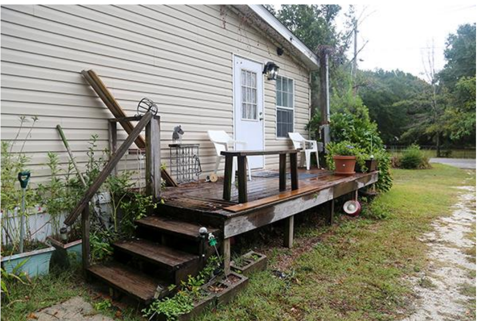
Before and after photos of the side porch at Charlotte Swearingen's home