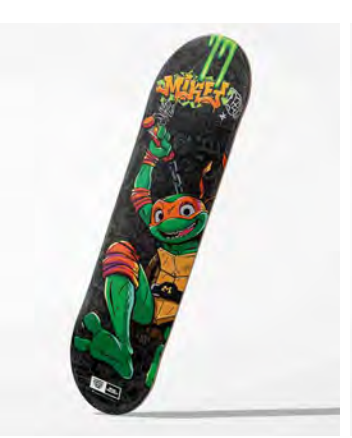
The Official "Mikey" Street Deck