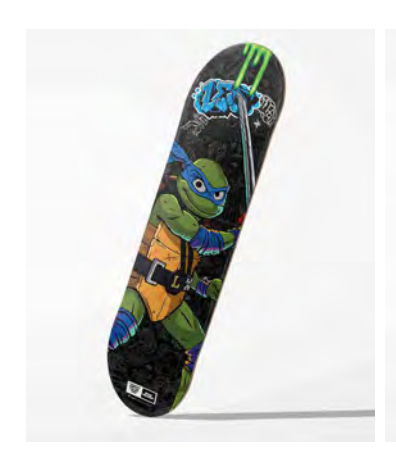
The Official "Leo" Street Deck