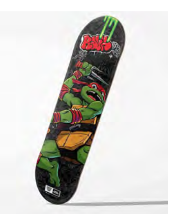
The Official "Raph" Street Deck