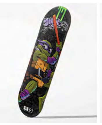
The Official "Donnie" Street Deck