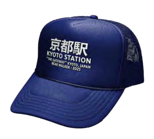
TRUCKER HAT WITH RAISED EMBROIDERY