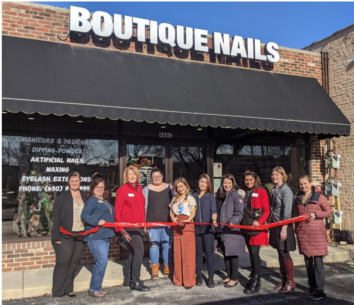
Boutique Nail Salon Grand Opening & Ribbon Cutting 488 Crescent Blvd., Glen Ellyn www.boutiquenailsalons.com

Boutique Nail Salon celebrated their Grand Opening with a Ribbon Cutting (488 Crescent Blvd., Glen Ellyn) on Friday, December 6. They are located in downtown Glen Ellyn. Boutique Nails provides a friendly and welcoming atmosphere with their professional services including nails, waxing and eyelash extensions. For more information visit their website www.boutiquenailsalons.com or call (630) 858-8999.