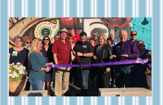
Ghett' Yo' Tacos, Burritos & Sliders 241 S Oregon Chandler, AZ 85225 website