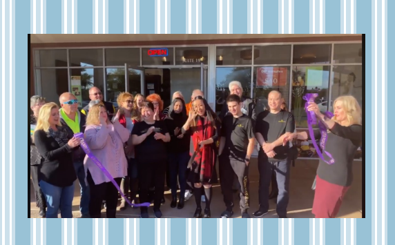
Thai Royal Massage and Day Spa 3454 W Chandler Blvd, Ste 19 Chandler, AZ 85226 website