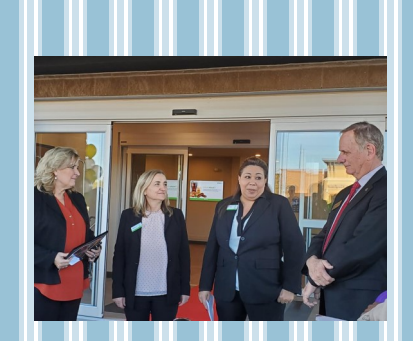
Extended Stay America 2055 W Chandler Blvd Chandler, AZ 85224 website