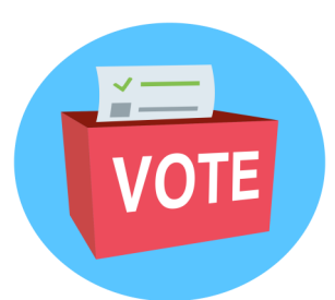
See more tools