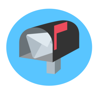
Vote early or by Absentee