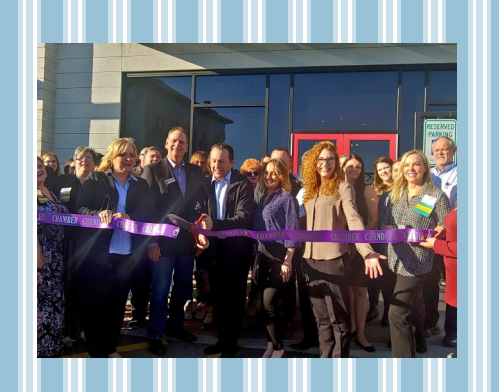
Thirsty Lion 3077 W. Frye Rd Chandler, AZ 85226 <u>website</u>