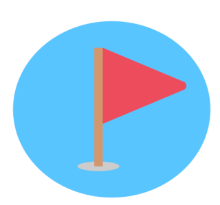
Find your polling Location