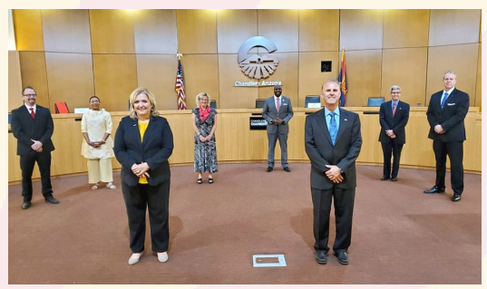
Watch the Chandler Chamber City Council Candidate forum on YouTube.