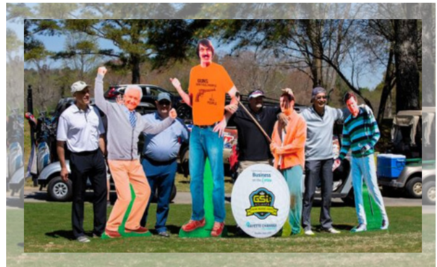
Graphic Signs Group Photo at their Sponsored Hole