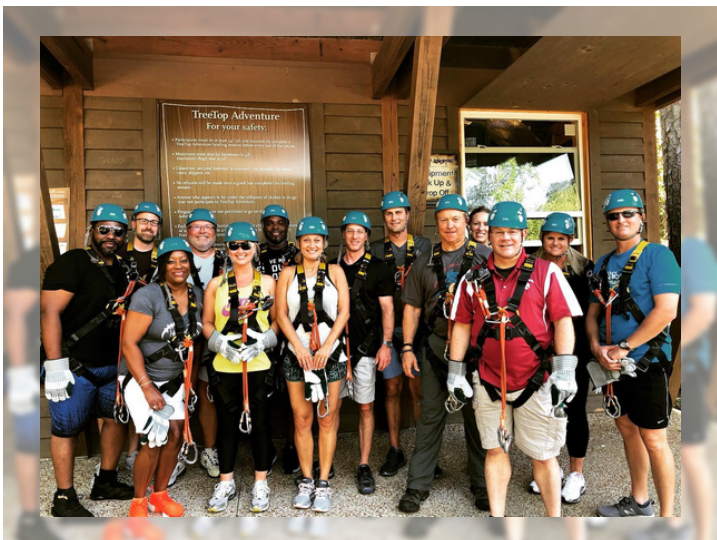
Leadership Fayette Class 2019-2020 at their Opening Retreat at Callaway Gardens