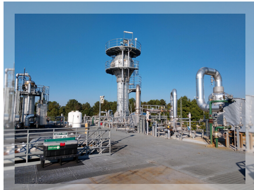
2019 Tour of Manufactures Council