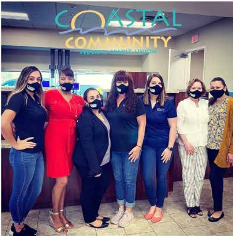
"Our essential employees want to make sure we keep our members, family and ourselves protected" Coastal Community Federal Credit Union, Galveston, TX

Join along with the Texas City-La Marque Chamber, the City of Texas City and the City of La Marque in our campaign, "Ask Why I Mask!" Use the hashtag #AskWhyIMask with a picture of you masked up and let us know why you wear your mask. Don't forget to tag the Texas City - La Marque Chamber of Commerce !