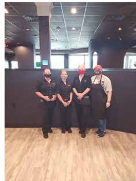
We 'mask up' for the safety of our community and employees! #staysafe " - Gus' in Texas City, TX