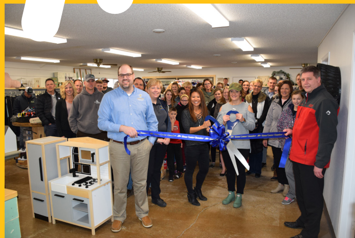
Outlet 75 Ribbon Cutting