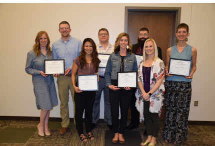
New Business Partner Awards