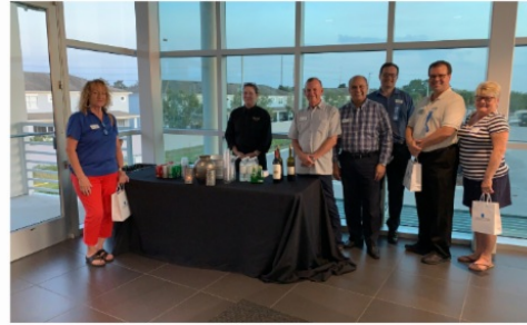
March 3, First Tuesdays at PrimeMed Medical Offices