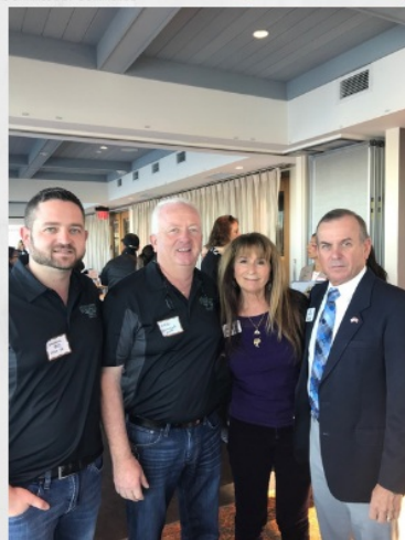
OUR FIRST 2019 ANNUAL MONTHLY SPONSOR: SHAMROCK AUTO BODY and SERVICE CENTER