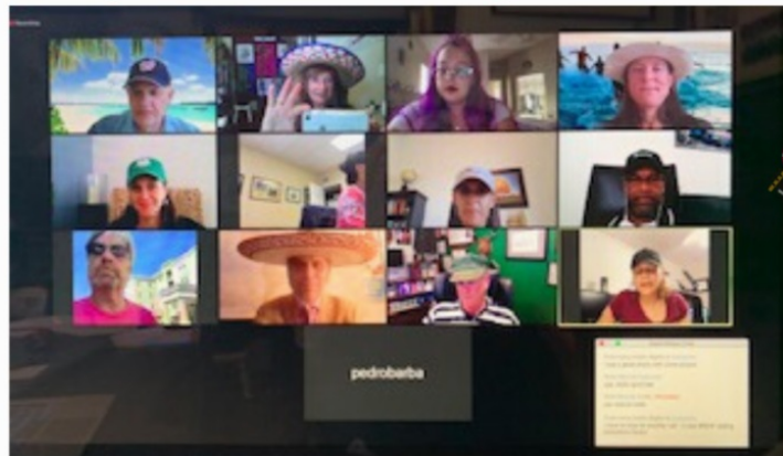
April 26, The Tuesday Zoom - "What's that Hat? How are you Engaging?"