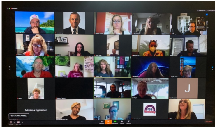
April 16, Board Meeting over Zoom