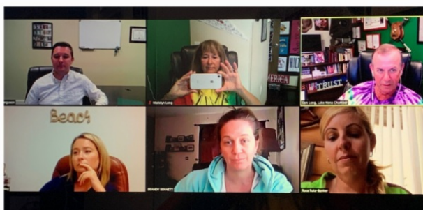
June 16, The Tuesday Zoom - "Rock it Out!"