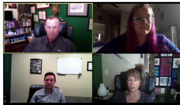
June 30, The Tuesday Zoom - "Lessons Learned and the Positives Gained"