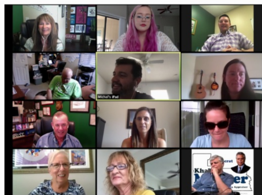
June 23, The Tuesday Zoom - "High School Yearbook Photo"