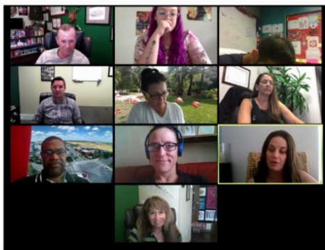
June 9, The Tuesday Zoom - "Show and Tell"