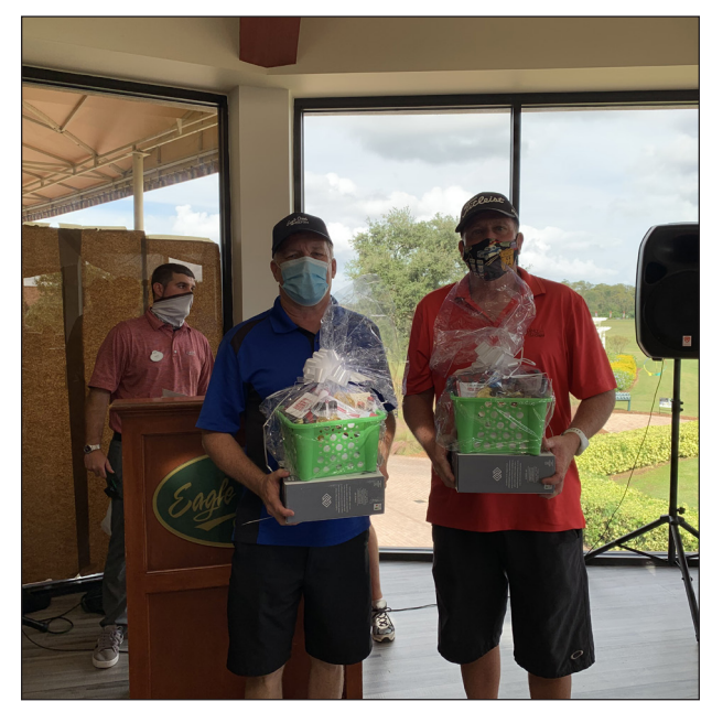
Nov. 6, "The Chamber Swing" Golf Tournament "Worst Golfers" Prize – The McConnie Fence Company Team. Sponsor American Balloon Décor crafted the inflatable prizes.