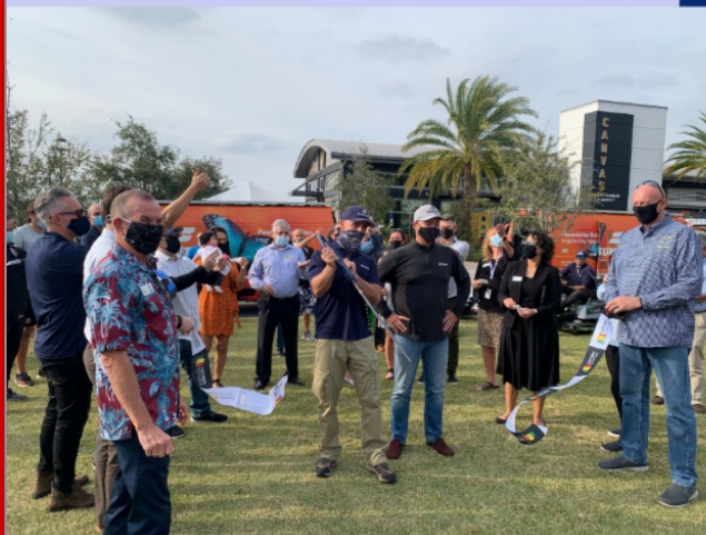
January 26, Ribbon Cutting for Suntek Zero Emissions Lawn Care - Suntek provides a real demonstration of their silent lawncare equipment and celebrates their membership at the lawn in front of Canvas Restaurant & Market.