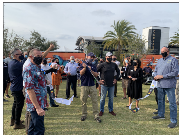
Jan. 26, Ribbon Cutting for Suntek Zero Emissions Lawn Care – Suntek provides a live demonstration of their silent lawncare equipment and celebrates their membership at the lawn in front of Canvas Restaurant & Market.