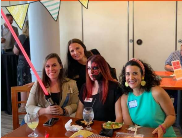
May 4, First Tuesdays at Eagle Creek "Cinco de Mayo" AND "May the 4th Be With You" - Chamber Members and visitors enjoy a nacho bar and relaxed networking at Eagle Creek's Belfry Restaurant.