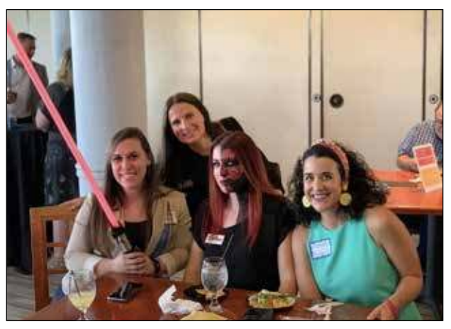
May 4, First Tuesdays at Eagle Creek and The Belfry Restaurant: "Cinco de Mayo" OR "May the Fourth Be With You" – Chamber Members and visitors enjoy a nacho bar and relaxed networking at Eagle Creek's Belfry Restaurant.