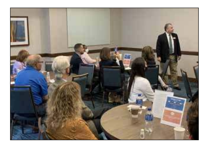
May 13, Breakfast Connections With Orange County Comptroller Phil Diamond – Guests attend a presentation by Orange County Comptroller Phil Diamond for breakfast at the Courtyard & Residence Inn by Marriott Orlando Lake Nona.