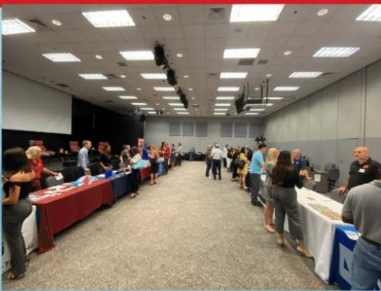
The Chamber Connections Event was held at Wycliffe Bible Translators and showcased the newest LNRCC Chamber Members on June 2.