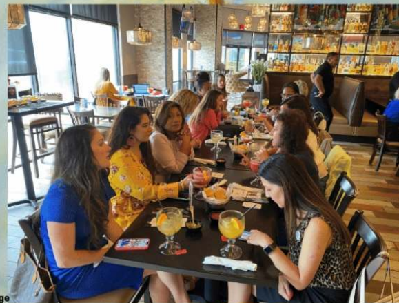
Nona Professional Ladies' Group held an Evening Social at Aztec Mexican Restaurant on June 28. Sponsor Red Door Title Group donated a fabulous door prize, and ladies enjoyed a whisky tasting from F&W Company LLC.