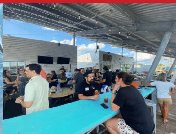
Arcimoto sponsors the First Tuesdays After-Hours Event on June 7 at Nona Adventure Park. LNRCC chamber members sample appetizers along with drink specials while professional networking with a sunset backdrop.