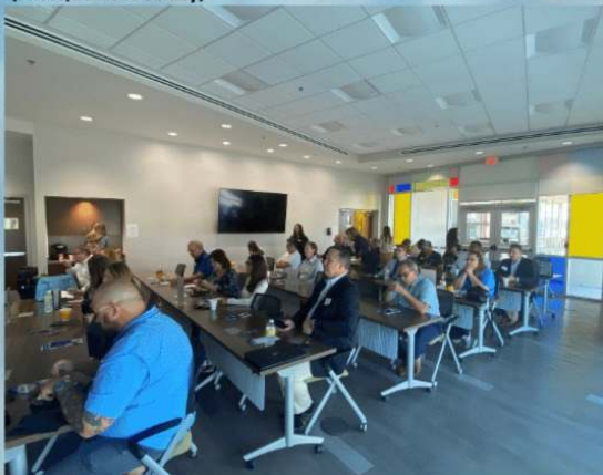
Lake Nona Regional Chamber of Commerce hosts an AdventHealth panel to discuss men's health at the Ronald McDonald House Charities in Lake Nona on June 9.