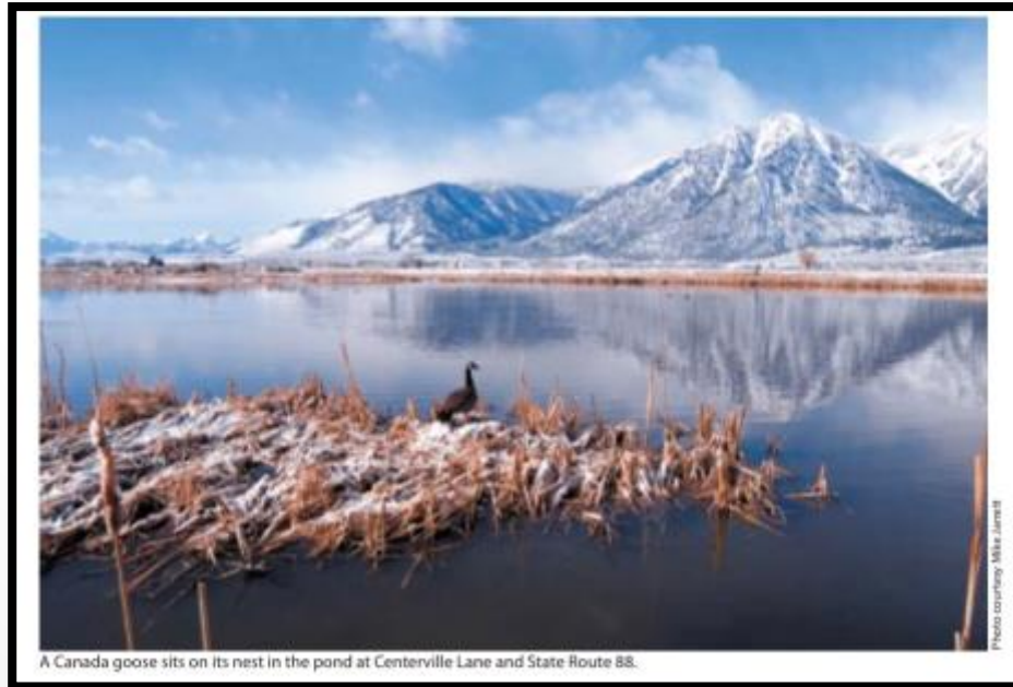
A Canada goose sits on its nest in the pond at Centerville Lane and State Route 88.

The Planning Commission unanimously adopted a Resolution in March 2020 requesting that the Board of County Commissioners incorporate an advisory question asking the voters to approve a 1/4 of a cent sales tax increase on the November General Election Ballot.