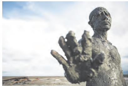
GRIT Mud Man Protester

the co-directors of the documentary "Grit"... Massachusetts filmmaker Cynthia Wade and San Francisco-based Sasha Friedlander. Their film is an exposé of Indonesia's mud disaster that buried sixteen villages, killed sixteen people, and displaced 60,000 people back in 2006 and the survivors who fought for restitution from the multi-national gas company responsible.