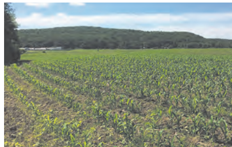
This family dairy farm, now conserved, includes highly productive soils, shoreline on the Connecticut River, open space for wildlife, and a rich heritage.