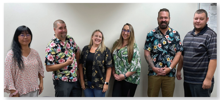
Our management team on Hawaiian Shirt Day…every Friday this summer at Monadnock Ford!

Monadnock Ford 119 Monadnock Hwy, Swanzey, NH (603) 283-5900 http://www.monadnockford.com/