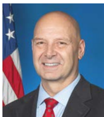
Senator Doug Mastriano

Nearly 200 people are expected to attend the breakfast, which has sold out in the past. General registration is $25 for members or $30 for non-members. Register online at Chambersburg.org/events .