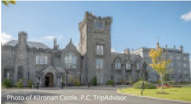
Photo of Kilronan Castle.