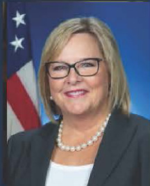
Senator Judy Ward