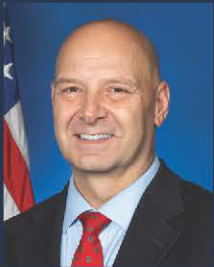
Senator Doug Mastriano

JOIN THE FRANKLIN COUNTY CHAMBERS OF COMMERCE FOR A LEGISLATIVE BREAKFAST FEATURING OUR STATE ELECTED OFFICIALS DISCUSSING IMPORTANT ISSUES AFFECTING THE BUSINESS CLIMATE IN SOUTH CENTRAL PENNSYLVANIA.*