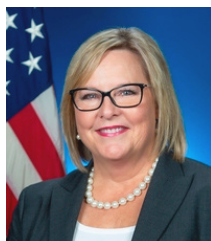
Senator Judy Ward