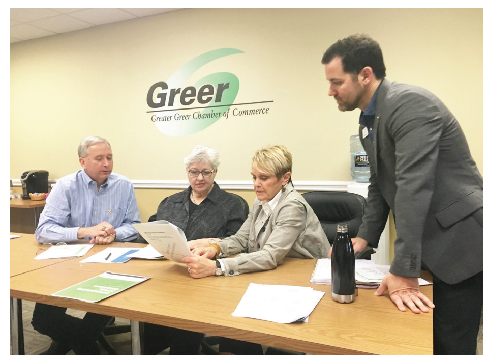
Members enjoying our Dale Carnegie Session- Communicating Across Generations

usinesses involved with the Greater Greer Chamber of Commerce have been extremely busy as of late! On November 19th, the Dale Carnegie Series wrapped up with a session titled "Communicating Across Generations." Attendees learned about generational differences, similarities, and traits that, when understood, can be used to build strong teams and lasting relationships.