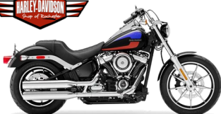
2020 Harley Davidson FXLR Low Rider Motorcycle