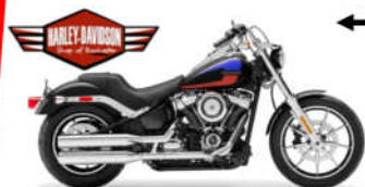
2020 Harley Davidson FXLR Low Rider Motorcycle