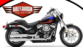
2020 Harley-Davidson FXLR Low Rider Motorcycle